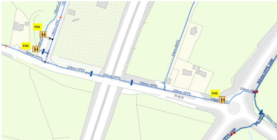
Figure 3: Fire Hydrant Location Plan